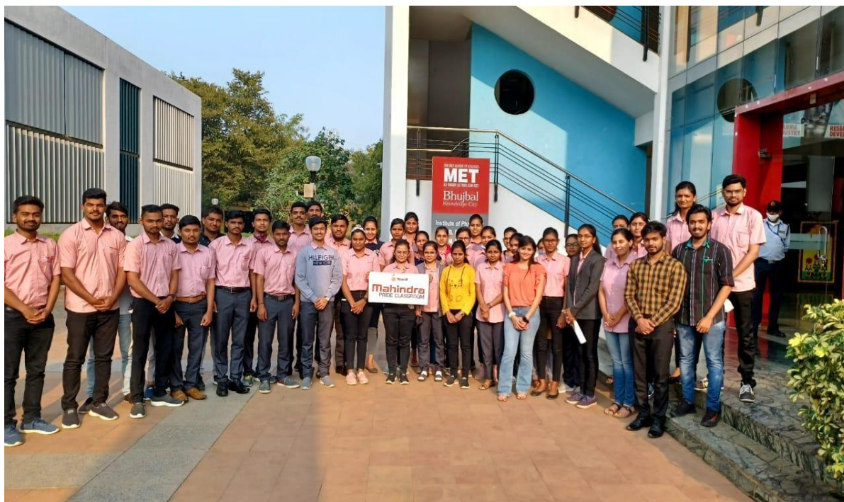
Mahindra Pride Classroom @ MET IOP

Participants: M.Pharm SEM III students (45)