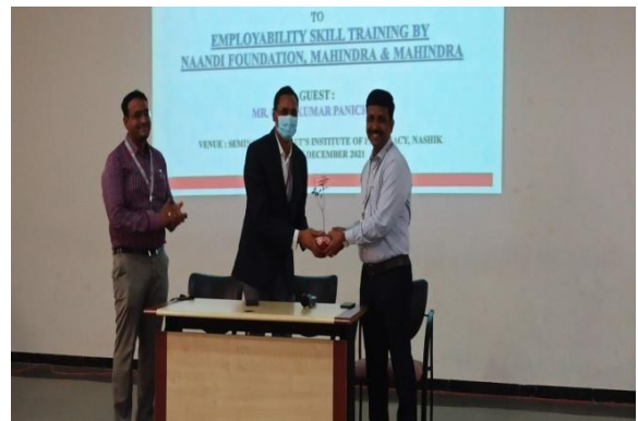
Gratitude for Naandi Foundation